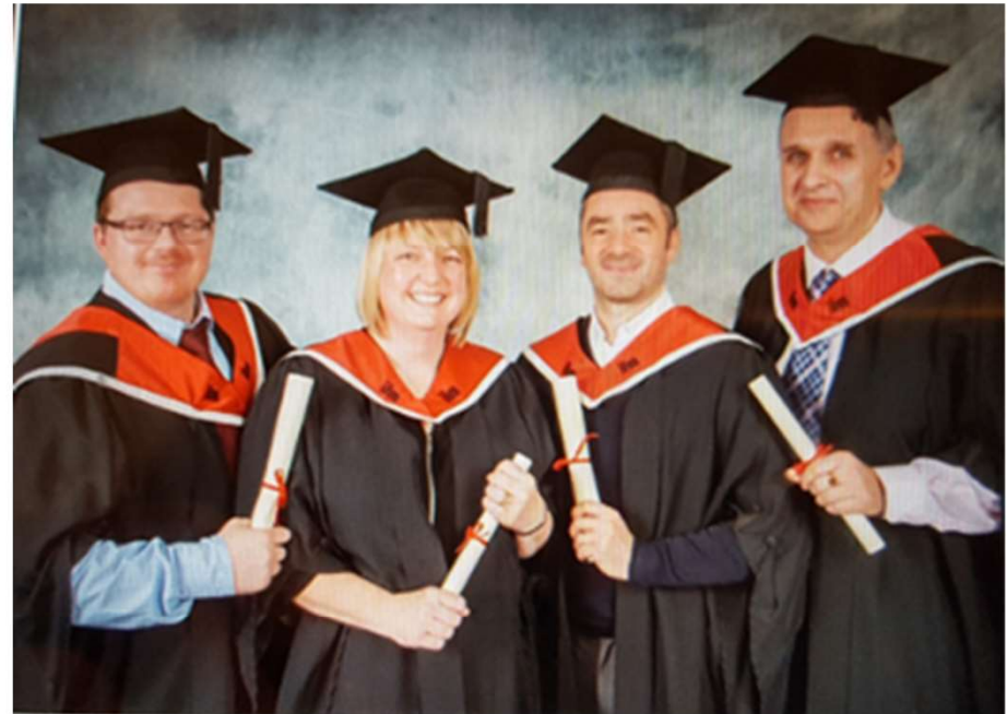
Level 5 ILAM Graduation