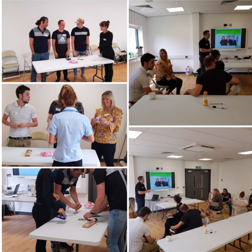
Apprenticeship Assessment Day